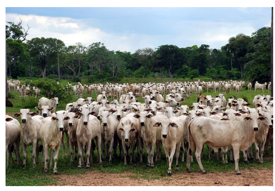
Cattle in the Brazilian Pantanal