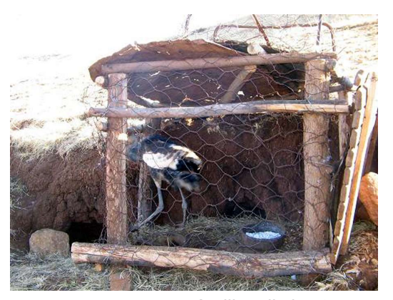
An illegally kept crane

The participants were divided into four working groups: supply, international demand, legislation, and research and conservation action. Within each of these groups, solutions and action steps were developed. The supply of cranes and local in situ issues need to address the key elements of poverty, cultural beliefs, the lack of awareness at a local level and the need for community empowerment. A review of current legislation to identify gaps and loopholes and the need for greater awareness of current local, regional and international legislation and policies were the key solutions to addressing the lack of adequate and weak legislation and law enforcement. In order to address the conservation and research project needs and responses to the trade issue, information on crane biology and ecology is required, networks for information exchange should be established, and communities should be involved in research and conservation programs. A full understanding of the extent and factors driving the international demand for cranes, the routes followed, and mortality rates need to be obtained. Sustainable captive populations need to be developed and broader awareness created around the crane trade and its effects on wild populations.