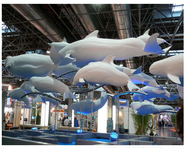
WAZA's DEADLINE project

The DEADLINE project for Ocean's Life, in collaboration with the NGO YaquPacha. DEADLINE works to reduce threats to vital ocean species and habitats, including bycatch, overfishing, ocean litter, pollution,