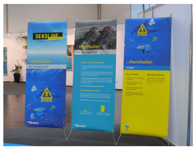
DEADLINE information booth at BOOT 2008

philosophy for zoos and aquariums across the globe and defines the standards and policies that are necessary to achieve their goals in conservation. The WZACS will be of use and interest not to only zoo and aquarium people but to anyone concerned with biodiversity conservation and sustainable development.